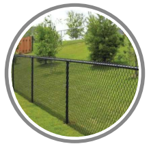
Vinyl-coated Chain Link