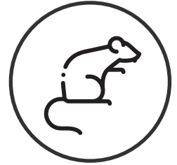
Rodents & Pests