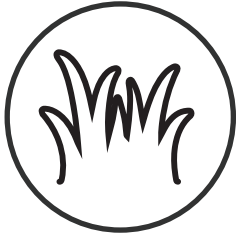
Grass and Weeds