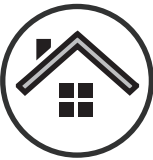
Roof & Siding