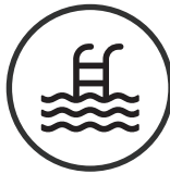
Pool & Spa