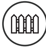
Fences & Walls